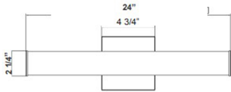
24"(W) x 2 1/4"(H)