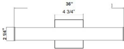
36"(W) x 2 1/4"(H)